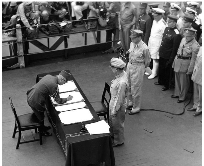
The signing of the declaration of surrender