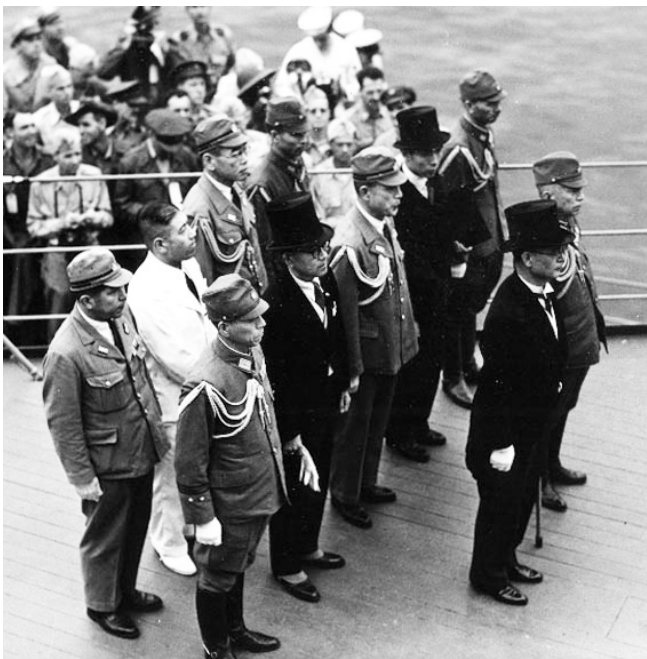
The Japanese Delegation on the deck of the Missouri

These extraordinary photos and many others are available on-line