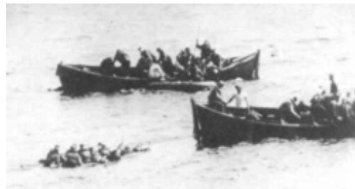
These two photos taken from the video show the rescue of Brownson survivors being taken into whaleboats and then to the USS Daly. Unfortunately the quality and resolution restricts the detail in any further enlargement.

After my 30 day survivor leave, I was assigned to Ship's Company Transportation at Great Lakes, Illinois. I was at Great Lakes for about a year, then assigned to the US Naval Ammunition Depot at Crane, Indiana. Around March 15th or the 20th, I was transferred to the Naval Air Station at Millington, Tennessee, and was Honorably Discharged from the United States Navy March 21, 1946.